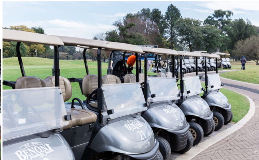
Country Club Golf carts all ready or action