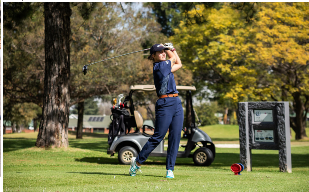
Bidair lady representative teeing off